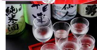
6types of drinking