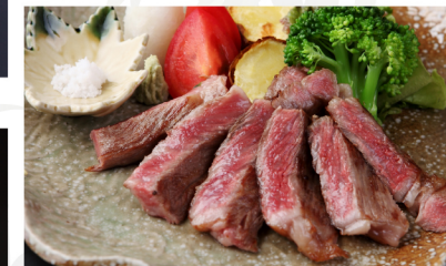
BenifSteak of Yamagatagyu