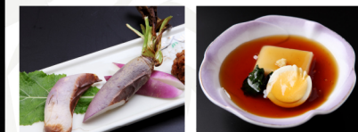
Baked fujiwakabu(raddish) Gomato-fu