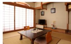
Japanese-Style Room with Shared Toilet and Bathroom