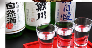
3types of drinking