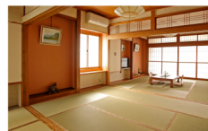
Japanese-Style Room with Private Toilet and Shared Bathroom