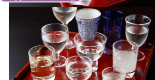
10types of drinking