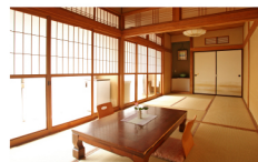
Japanese-Style Room with Private Toilet and Shared Bathroom